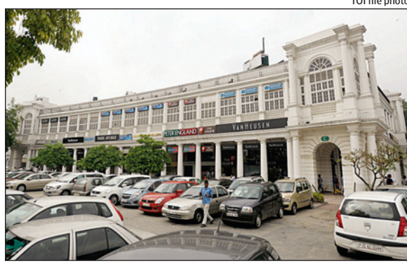
DIMTS has taken over more than 90 of the 104 parking spaces

"Some market associations, such as those in Khan Market and Shankar Market, have agreed to run their parking lots themselves under the Bhagidari Scheme They will have to pay us the revenue collected before the renewal of contract and they