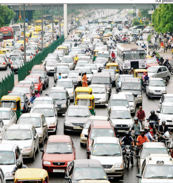
GRIDLOCKED: The scene at ITO on Monday afternoon

lems for the commuters was the ad hoc traffic management as well as no advance warnings. As a result, huge tailbacks were seen in all directions. Though police insisted they had a diversion plan in place, it seemed to have had little effect.